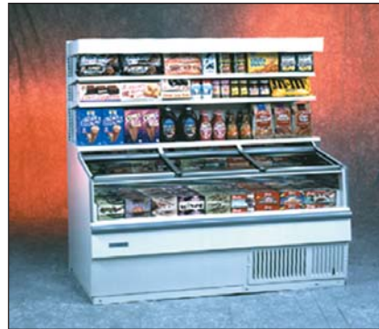
LBN-6 With Optional Superstructure