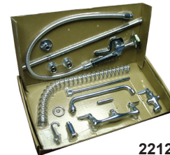
22124 Wall mounted, with faucet.