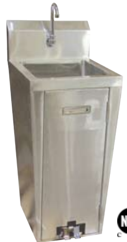
Made of high quality stainless steel. Comes with a 7.75" backsplash and 34" pedestal.