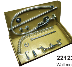
22123 Wall mounted