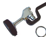
23518 - Pre-rinse spray valve assembly