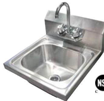
22288: Hand sink w/knee valve, faucet and drain