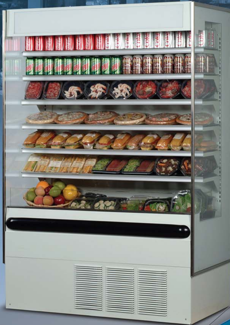
Shown With Optional Lighted Sign

Versatile merchandiser with 26" depth is ideal for applications that require maximum product facings with a minimum of floor space used