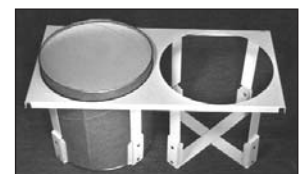
Canholder Kit with Side Rails

Now available... a choice of two different ice cream canholder kits and a Gelato kit so you can choose the display accessories that best fit your needs.