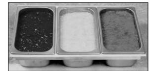
Optional Gelato Pan Racks