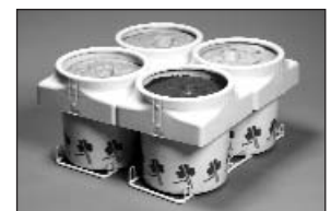
Canholder Kit - New Style with Plastic Hood and Wire Rack System