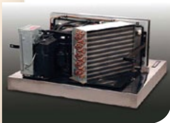
Removable refrigeration cassette.